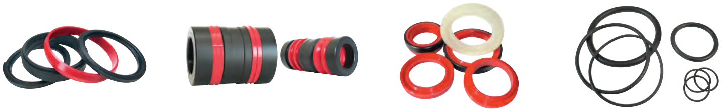
piston seal, rod seal, wiper, guide ring, backup ring, d-ring, o-ring, x-ring, oil seal, roto slide seal, v-ring and others